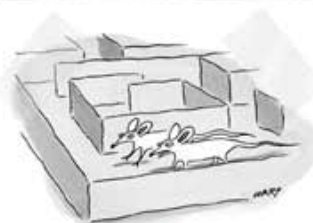
What's so funny? Click here for this month's The New Yorker cartoon.

New Exhibitor Marketing Toolkit Unveiled for LabAutomation2008 Exhibitors